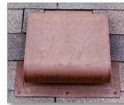
8" EZ-PLUG Patch Designed for patching holes left by Pot and Turtle Vents. Fills holes up to 8" x 8"