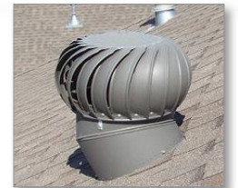
12" EZ-PLUG Patch Ideal size for filling holes left by Whirlybird/Turbine vents. Fills holes up to 12" x 12"