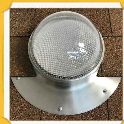
LightBlaster Shingled Roof design (also offered for metal roofs)

SPECS: Material: 14 gauge aircraft aluminum Size: 8.5" wide tubular skylight (template is included) Unit height from rooftop: 6" Light tube size: 3" height x 8.5" diameter Inside Diffuser height: flush with ceiling Box: 14"x14"x7"; 3.5 lbs (gross weight); 2.25 lbs (net weight)